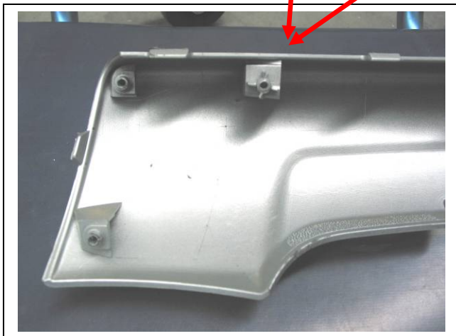
Figure 1: End screws of lower centre, removed from vehicle for photo.