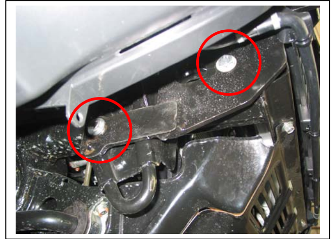
Figure 4: Bolt pattern on drivers side of vehicle.