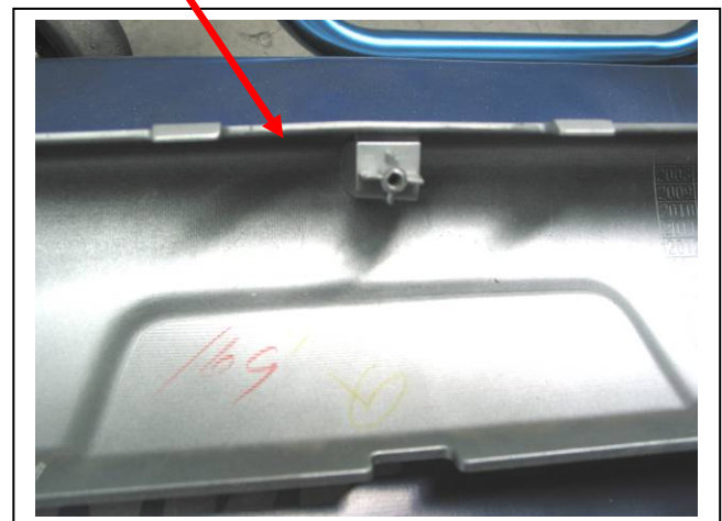
Figure 2: Centre screw of lower bumper centre, removed from vehicle for photo.