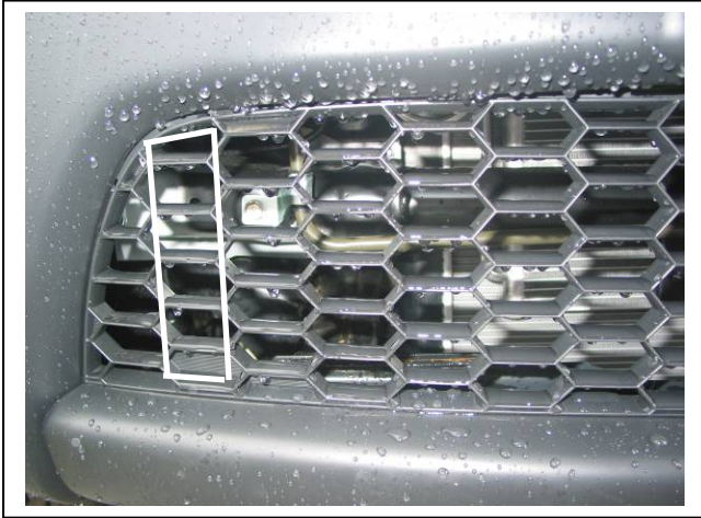
Figure 3: Area to be trimmed on lower centre grille.