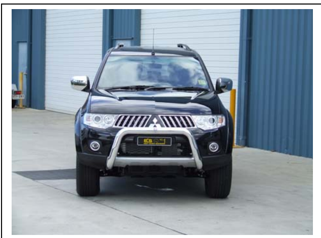
Figure 5: Front view