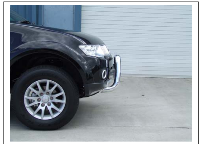
Figure 6: Side view